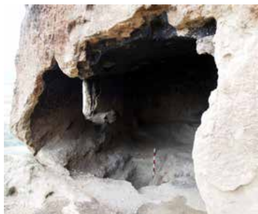
Fig. 6. View into Room 1, looking southwest. Note the remains of the lintel at the top, the window at left, and the grave in the floor.

Room 1 opens onto the west side of a small, southern-facing terrace. Three square cuttings in the cliff face just above the doorway were not intended for icons or fresco but for the ends of wooden beams; they suggest that at least one additional room was located in front of Room 1 and that both were part of a larger complex. Radojčić was certainly correct about multiple rooms.