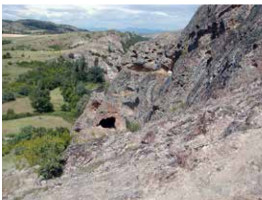
Fig. 2. The entrance to Room 1, from east. Note the cliff into which the room was carved and the stairs going up to the ledge.

Сл. 2. Улаз у просторију 1, са истока. обратите пажњу на литицу у коју је урезана просторија и степенице које иду горе на зараван.