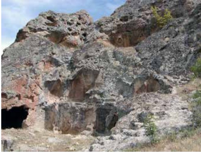
Fig. 7. The small terrace and the face of the cliff with tiers of spaces; from southeast.

Сл. 7. Мала тераса и лице литице са просторима у нивоима; са југоистока.