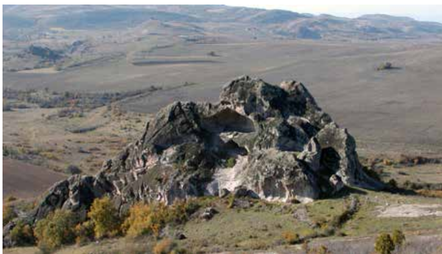
Fig. 9. Cocev Kamen; from northeast. Note the spaces and features carved into the bedrock.

Сл. 9. Цоцев Камен, са североистока. Обратите пажњу на просторе и облике урезане у стену.