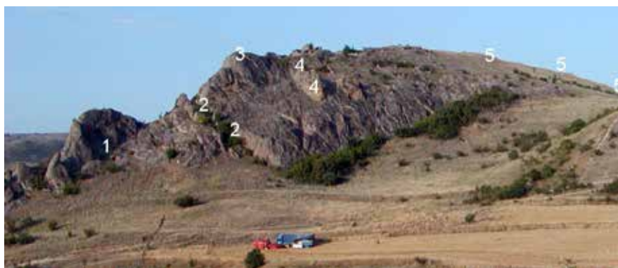
Fig. 1. The acropolis ridge of Golemo Gradište, from the southwest. #1 marks the terrace where Room 1 is located, #2 the ravine that cuts the western end of the ridge off from the rest, #3 the lookout post, #4 the bedrock west wall of section D, and #5 is the eastern plateau C.

Сл.1. Гребен акропоља на Големом Градишту, са југозапада. #1 означава терасу где се налази просторија 1, #2 јаруга која одесеца западни део гребена од осталог дела, #3 видиковац, #4 западни зид бедема секције Д, а #5 је источни плато Ц.