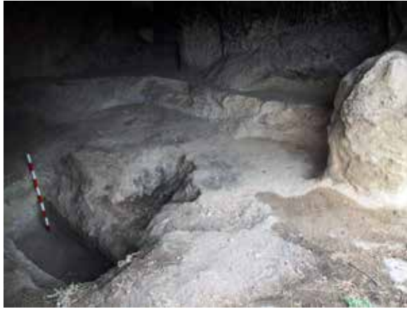
Fig. 4. The interior of Room 1, looking northwest. Note the grave at lower left, the bench along the north wall, and the damaged doorjamb at right.

Сл. 4. Унутрашњост просторије 1, гледајући са северозапада. Обратите пажњу на гроб у доњем левом делу, клупу дуж северног зида и оштећен отвор врата десно.