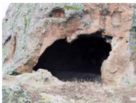
Fig. 3. The entrance to Room 1, detail.

Сл. 2. Улаз у просторију 1, са истока. обратите пажњу на литицу у коју је урезана просторија и степенице које иду горе на зараван.