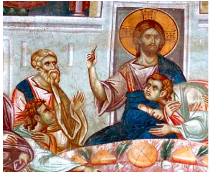
Fig. 10 St. George in Staro Nagoricino (1317/18), Last Supper, detail

Сл. 10 Св. Ђорђе у Старом Нагоричину (1317/18), Тајна вечера, детаљ