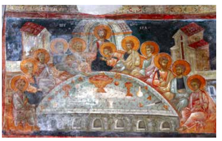
Fig. 7 Holy Mother of God in Kuceviste (ca. 1330), Last Supper Сл. 7 Св. Богородица у Кучевишту (око 1330), Тајна вечера

we today know, instead of picturing the Last Supper as a tragic event of dramatic disclosure, this Gospel depicts the Passover banquet as the closing episode of the great conspiracy to effectuate Christ's teachings through the treasonable role