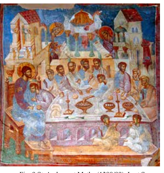
Fig. 9 St. Andreas at Matka (1388/89), Last Supper Сл. 9 Св. Андреја на Тресци (1388/89), Тајна вечера

tion of the church dedicated to Saint George in the village of Staro Nagoričino<sup>24</sup>, where one can acknowledge the final stage of promotion of the perfectly elaborated compositional design, radiating with absolute balance of iconographic components and their symbolic references. The rich repertoire of means of expression, as well as the skilfulness in the process of structuring of the compositional matrixes, reflect the methodical discipline of the painterly discourse which radiates with its pretentious meticulousness. However, the glamorous abundance of selected details and the manner of their organiza-