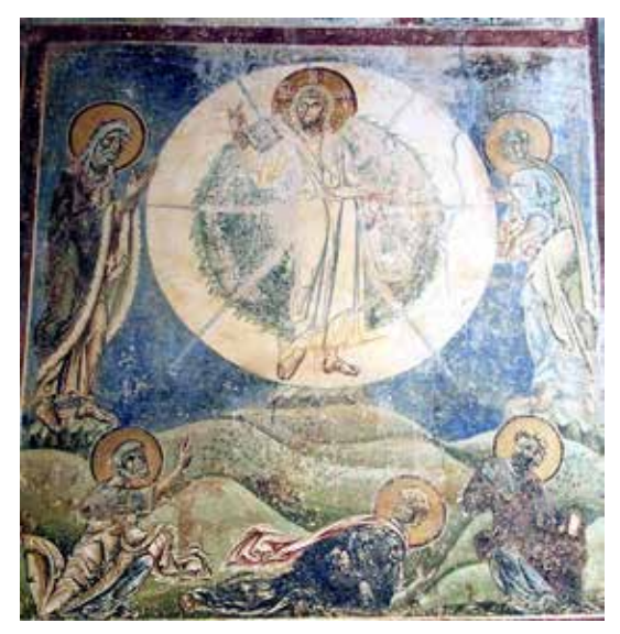
Fig. 1 St. George in Kurbinovo (1191), Transfiguration Сл. 1 Св. Ђорђе у Курбинову (1191), Преображење

This can be observed even in the case of the greatest of all the great painters of all times, the astonishing and glamurous megamaster of art - Leonardo da Vinci3. In his master-piece, the fresco painting illustrating the Last Supper in the refectory of Santa Maria delle Gracie in Milan<sup>4</sup>, the Renaissance genious ventures upon what is considered the most innadmisslible trespass in religious artistic expression. Namely, in the impeccable compositional design of the scene depicting the moment of the fateful disclosure of the Betrayal, instead of depicting the figure of the young apostle John, who is, by deafult, supposed to ex-