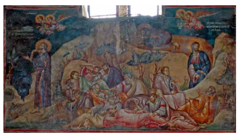
Fig. 3 Holy Mother of God Peribleptos in Ohrid (1295), The Prayer at Getsemane Сл. 3 Св. Богородица Перивлепта у Охриду (1295), Молитва у Гетсиманији

Fig. 4 Holy Mother of God Peribleptos in Ohrid (1295), The Prayer at Getsemane, detail