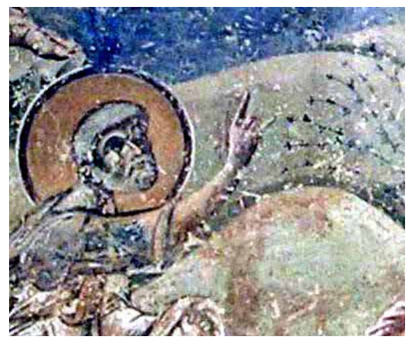
Fig. 2 St. George in Kurbinovo (1191), Transfiguration, detail

Сл. 2 Св. Ђорђе у Курбинову (1191), Преображење, детаљ