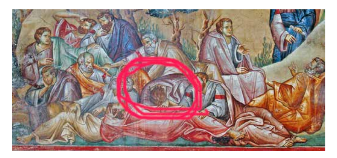
Fig .5 Holy Mother of God Peribleptos in Ohrid (1295), The Prayer at Getsemane, detail Сл. 5 Св. Богородица Перивлепта у Охриду (1295), Молитва у Гетсиманији, детаљ

configured by Michael and Eutychios in this ensemble, is usually based upon the piercing energy of the depicted figures, the dramatic rhythm of their gestures, the kinetic dynamism of the various postures and the narrative density of the expressive emotions portrayed with strong light contrasts and exciting clash between the painted nuances<sup>16</sup>. However, the most remarkable feature of the innovative painterly language of the masters that defines the fresco ensemble of the Peribleptos church is the dramatic atmosphere of the illustrated events, among which, for the purpose of this paper, we have chosen the composition depicting the Prayer in the Mount of Olives<sup>17</sup> (Fig. 3). Once again, according to the Gospels, the expressive prayer of Jesus at Gethsemane takes place after the Last Super has finished and Judas had left the feast to betray his master (Mathew: 26, 36-47; Mark: 14, 32-43; Luke: 22, 39-47). Correspondingly, the number of the apostles following Christ in the Garden should be reduced by one, compared to those who attended the Last Supper (Mathew: 26, 20; Mark: 14, 17; Luke: 22, 14). In other words, if Judas has left the banquet to complete his task of betraval, the number of the apostles who accompanied Jesus to the Olive Garden should be no more than eleven.