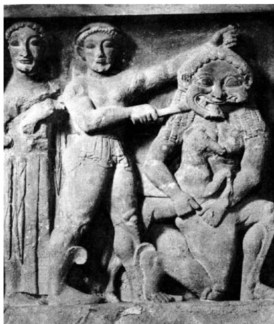
Fig. 10. Perseus cuts the head of Medusa. Sixth century B.C. Marble relief from the temple in Selinunt, Sicily. Palermo, National museum

The iconography of Saint Tryphon on a horse with a bird became dominant in Russian icon painting (Fig. 8). Although possibly this image reflects traces of his cult as a soldier, this iconography developed late and does not include any depiction of weapons or armor. As the Russian historian Nikolai Malitskii stated in 1932, the cult of Saint Tryphon in royal circles was influenced by the life of this holy man of ancient times: his occupation as a geese herder gave rise to the tradition of depicting him with a bird. 20 The visual representation of Saint Tryphon with a bird can also be found in post-Byzantine Greek iconography. There the bird resembles a dove – the symbol of the Holy Spirit, but, if one trusts Malitskii's opinion, the bird represents neither a dove nor a hunting falcon but rather a goose.