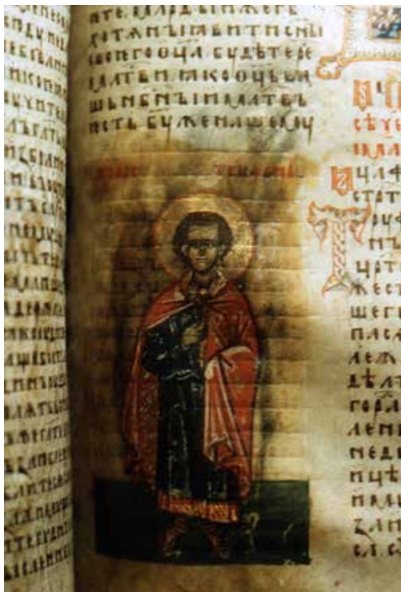
Fig. 3. St. Tryphon. The miniature from the Prolog “Typografskiy”, Novgorod, end of the fourteenth – beginning of the fifteenth century. Moscow, Russian State Archive of the ancient documents, fund 381 (Sin. typ.), cod. 162, fol. 229

Сл. 3. Св. Трифун. Минијатура из Пролога „Типографски“, Новгород, крај XIV – почетак XV века. Москва, Руска државна архива древних списа, фонд 381 (Sin. тип.), cod. 162, fol. 229