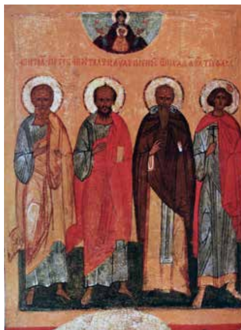
Fig. 5. Apostles Peter and Paul, blessed Dios, martyr Tryphon. The icon from the region of Ngorod, fifteenth century. St. Petersburg, Russian Museum

Сл. 4. Св. Трифун, Мајка Божија, Симеон Богопримац. Детал са календара, иконе за месец фебруар, XV век. Из збирке Феодор Каликин. Санкт-Петербург, Државни Ермитаж.