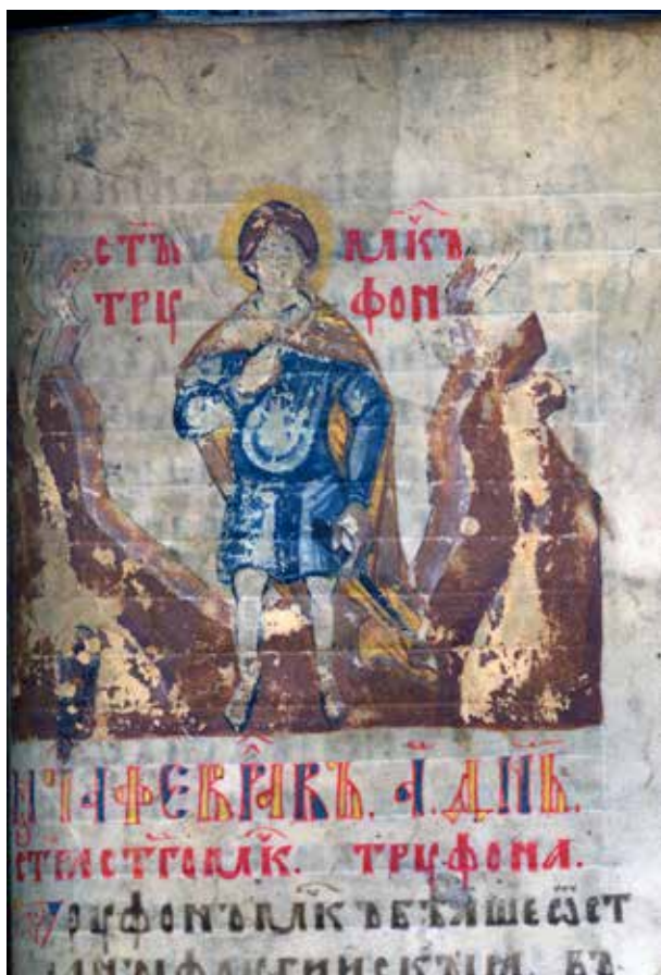
Fig. 1. St. martyr Tryphon. The miniature from the Prolog "Pogodinskiy". Novgorod, end of the fourteenth century. St. Petersburg, National Library of Russia. Pogod. 59, fol. 280

Сл.1. Св. мученик Трифун. Минијатура из Пролога „Погодински“. Новгород, крај XIV века. Санкт-Петербург, Народна библиотека Русије. Погод. 59, фол. 280