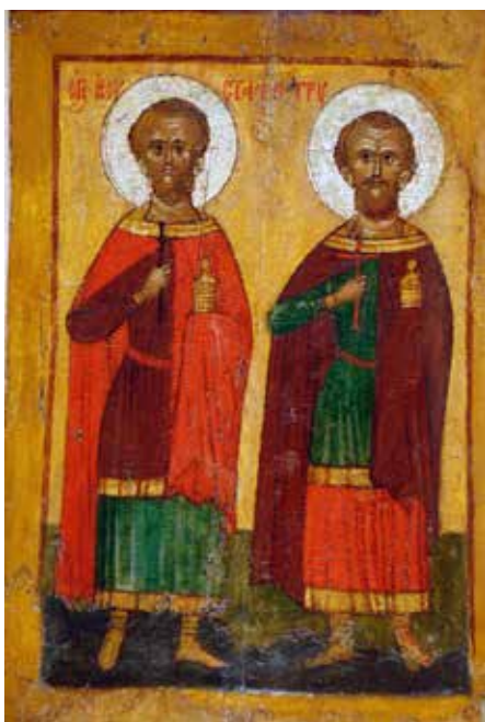
Fig. 6. St. martyrs Eustathios Placidus and Tryphon. Fifteenth century. Petrozavodsk, Museum of the fine arts of Karelia

Сл. 6. Ст. Мученици Еустахије Плацида и Трифун. XV век. Петрозаводск, Музеј ликовних уметности из Карелије