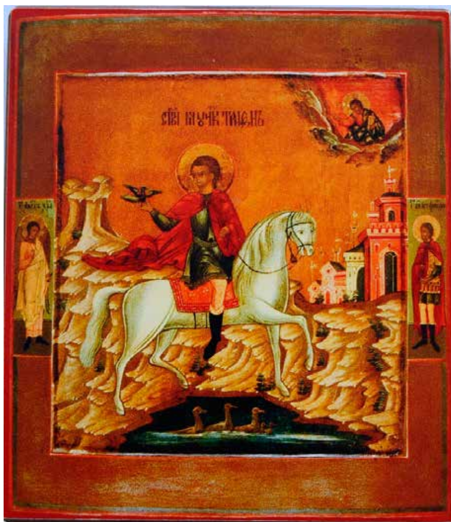
Fig. 7. St. Tryphon with the falcon. Russian icon from the eighteenth century. Private collection

Сл. 7. Св. Трифун са соколом. Руска икона из XVIII века. Приватна колекција