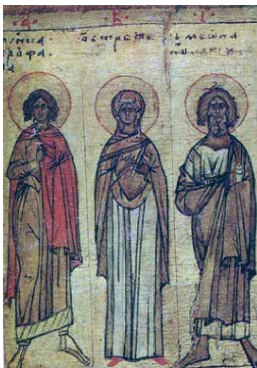
Fig. 4. St. Tryphon, Mother of God, Symeon the God-Receiver. Detail of the Calendar- icon for the February, fifteenth century. From the collection of Feodor Kalikin. St. Petersburg, State Hermitage

Сл. 4. Св. Трифун, Мајка Божија, Симеон Богопримац. Детал са календара, иконе за месец фебруар, XV век. Из збирке Феодор Каликин. Санкт-Петербург, Државни Ермитаж.