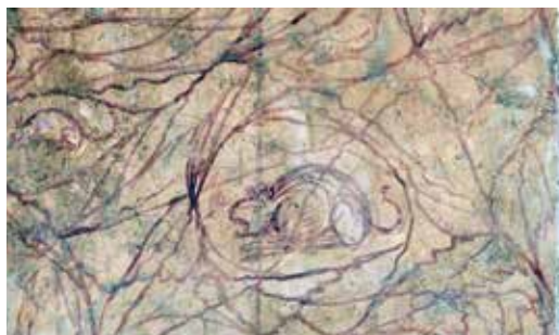
Fig. 2, Stobi, Episcopal basilica, The rat and the mouse

Сл. 1 Стоби, Епископска базилика, северо-западни пиластар