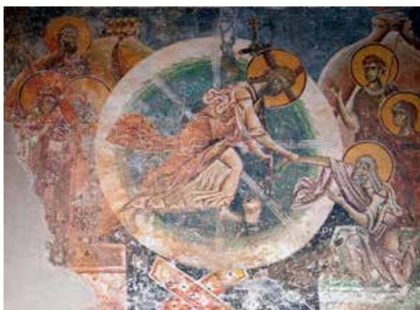
Fig. 6, Saint Georges at Kurbinovo, Narrowing of Hell Сл. 6 Свети Ђорђе у Курбинову, Силазак у пакао