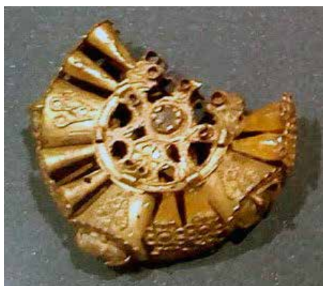
Fig. 10, Site of Gorno Orizari, Kocani, Golden earrings

Сл. 10 Локалитет Горно Оризари код Кочана, Златне наушнице