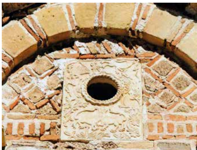
Fig. 12, Saint Nicholas Šiševski, Architectonic decoration

Сл. 12 Свети Никола Шишевски, Архитектонска декорација