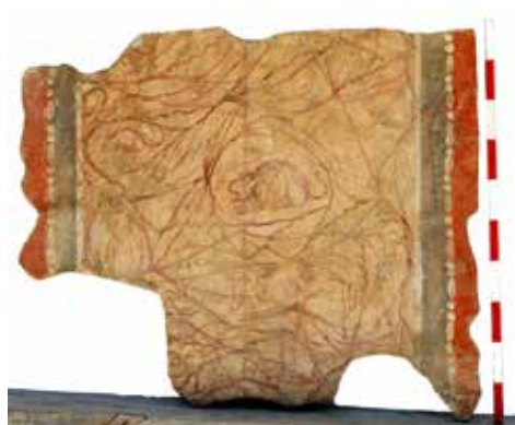
Fig. 1, Stobi, Episcopal basilica, North-west pilaster

Сл. 1 Стоби, Епископска базилика, северо-западни пиластар