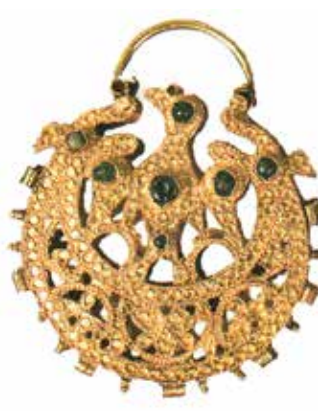
Fig. 11, Site of Gorno Orizari, Kocani, Golden earrings

Сл. 10 Локалитет Горно Оризари код Кочана, Златне наушнице