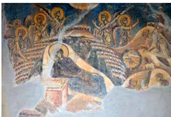
Fig. 7, Saint Georges at Kurbinovo, The Nativity Сл. 7 Свети Ђорђе у Курбинову, Рађање Христа