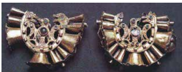
Fig. 9, Site of Markovi Kuli, Varosh, Prilep, Golden earrings Сл. 9 Локалитет Маркових кула у Вароши код Прилепа, Златне наушнице

these circumstances, having in mind the chronological, religious and the cultural time-frame of the Komani-Kruje rondela pendant, one possible attribution of the female representation appears to be the daimona (spirit) Genetyllis 19 . The given nomenclature comes from an entry in a later source i.e. the 10 th century Suda ( Souda ), but it is quite plausible that the notion of the Genetyllis was present prior to the actual compilation of the written encyclopedic source. The Suda associated the Genetyllis with Aphrodite and Eileitheia , the second being frequently related to Hera , Artemis and Hecata in the Greek Pantheon. Eileitheia , the presumed Minoan effigy of earlier procreation goddesses became a goddess of childbirth and midwifery in Ancient Greece. Thus she received an important role in the religious cult, as well as in matters in everyday life. When depicted, she is usually represented in a kind of an orans pose, with her hands raised in the air as if she is about to receive the newborn child.