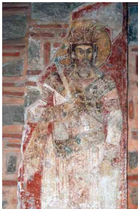
Fig. 16 St. Archangel Michael, Prilep, King Marko

Сл. 15 Св. Арханђео Михаило у Прилепу, Краљ Марко