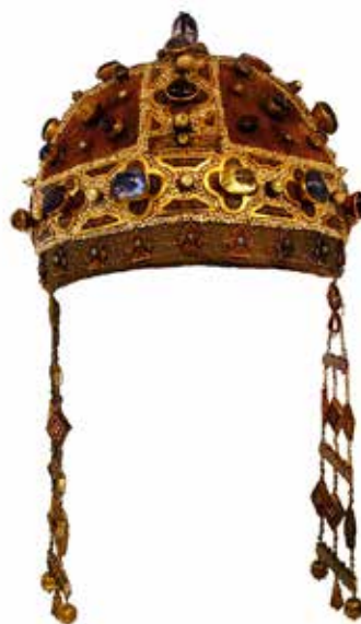
Fig. 19 Cathedral of Palermo in Italy, Crown of Constance of Aragon

In his other portrait, depicted on the south façade of Marko's monastery ( Fig. 17 ), the King has a different facial expression, a different type of crown and outfit 37 , and definitely a different attitude, most probably generated in the specific political circumstances of the historic momentum around 1390 38 . As we have pointed out in one of our previous Niš and Byzantium presentations, the extraordinarily designed image of King Marko on the façade of his endowment in Sušica was painted as a visually structured metaphor of his royal legitimacy after the death of his political rivals in the battle of Kosovo Polje 39 . In that regard, he is holding a replica of the horn with the ointment of which Old Testament Kings were anointed by their coronation 40 . This certainly makes King Marko's portrait in Sušica much more ceremonial than the one in Prilep since the dark purple robe, which says I am no longer in mourning for my dead father , altogether with the massive horn full of ritual ointment, are the main contributors to Marko's solemnly royal ap-