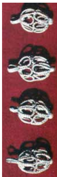
Fig. 6 Island of Golem Grad in Prespa Lake, Resen, Buttons, 14 th century, (Grave find), (photo by V. Kiprijanovski)

Сл. 5 Ризница са Маркових Кула у Прилепу, Господарски венац, 14 век (цртеж према Е. Маневој)