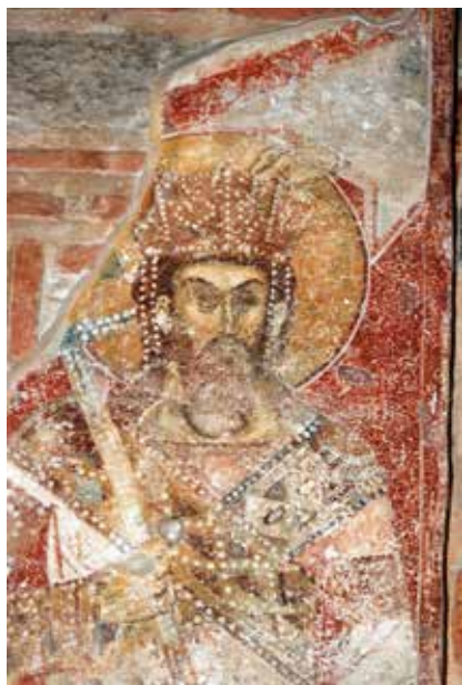
Fig. 15 St. Archangel Michael, Prilep, King Marko

Сл. 15 Св. Арханђео Михаило у Прилепу, Краљ Марко