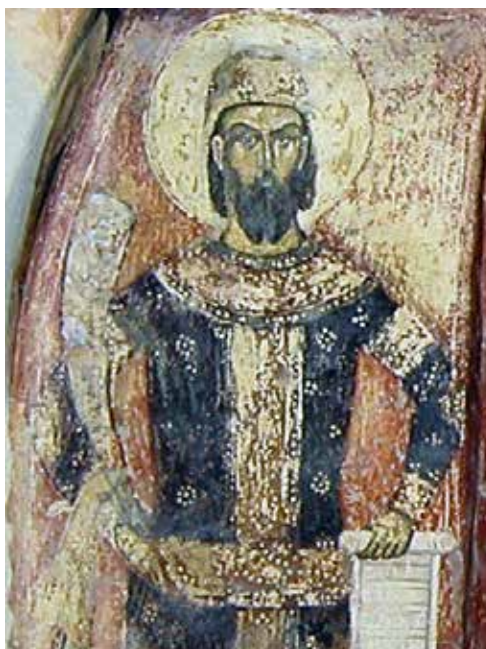
Fig. 18 St. Demetrius, Sušica, King Marko

Сл. 17 Св. Димитрија у Сушици, Краљ Марко