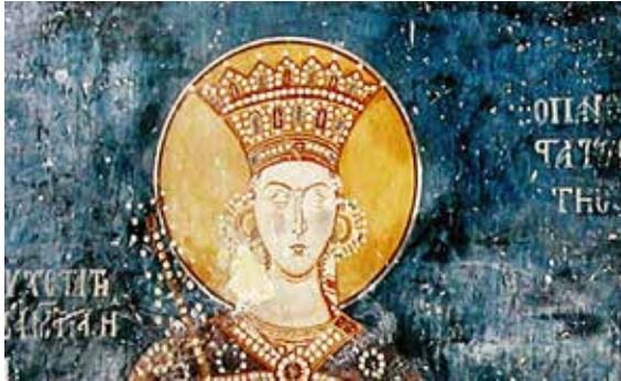
Fig. 3 St. Archangel Michael, Lesnovo, Despotessa Ana Maria

Сл. 3 Св. Арханђео Михаило у Леснову, Деспотица Ана Марија