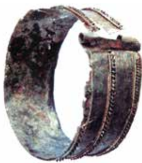
Fig. 14 Necropolis Krstevi, village of Korešnica, Demir Kapija, Bracelet, 10 th – 11 th centuries

Сл. 13 Константинопољ, Наушнице, 6-8 век, византијске, Метрополитен Музеј у Њу Јорку