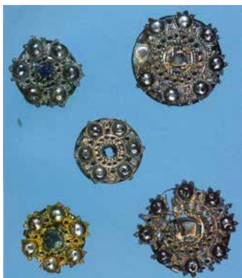
Fig. 10 Site of St. Athanasius, Varoš, Prilep, Agraphs, 14 th century

Сл. 9 Горно Оризари код Кочана, Наушнице из ризнице 14 века