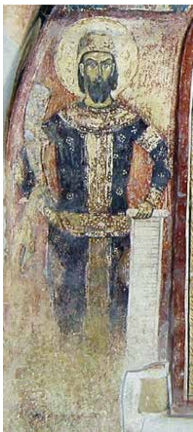
Fig. 17 St. Demetrius, Sušica, King Marko

Сл. 17 Св. Димитрија у Сушици, Краљ Марко