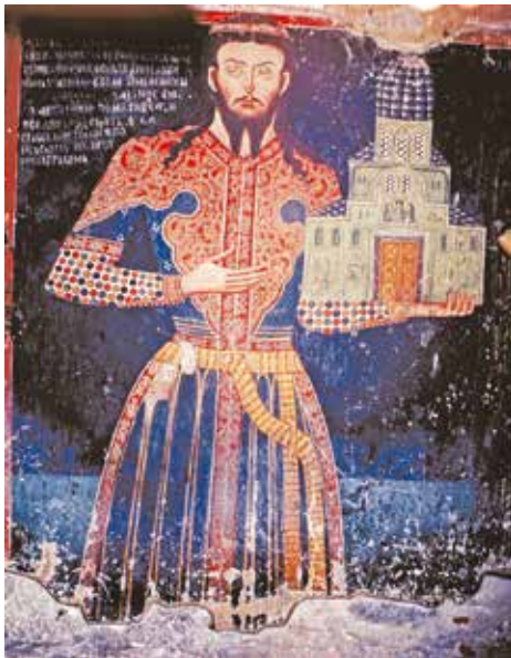
Fig. 2 St. Archangel Michael, Lesново, Sebastocrator Jovan Oliver

Сл. 1 Св. Арханђео Михаило у Леснову, Севастократор Јован Оливер