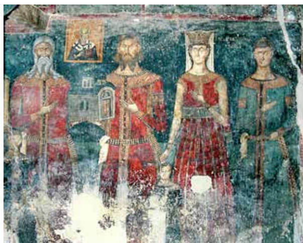
Fig. 12 St. Nicholas, Psača, Vladislava, wife of Sebastocrator Vlatko

Сл. 11 Св. Никола у Псачи, Владислава, супруга Севастократора Влатка