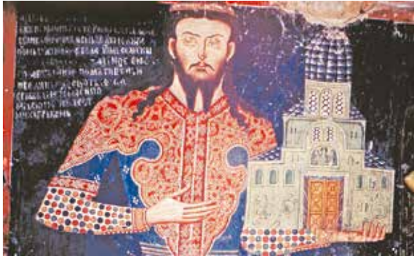
Fig. 1 St. Archangel Michael, Lesново, Sebastocrator Jovan Oliver

Сл. 1 Св. Арханђео Михаило у Леснову, Севастократор Јован Оливер