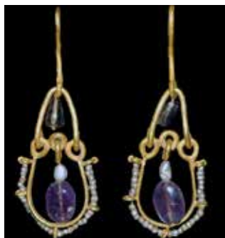
Fig. 13 Constantinople, Hanging Earrings, 6 th – 8 th centuries, Byzantine, Metropolitan Museum of Art

Сл. 13 Константинопољ, Наушнице, 6-8 век, византијске, Метрополитен Музеј у Њу Јорку