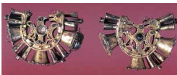
Fig. 9 Gorno Orizari, Kočani, Earrings, Treasure from 14 th century

Сл. 8 Марков Град – Маркова Кула, Просек, село Корешница, Појасна копча (10-11 век)