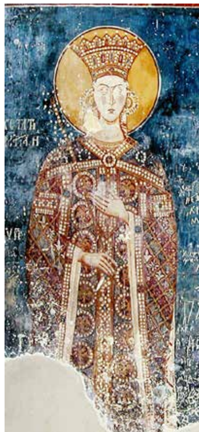
Fig. 4 St. Archangel Michael, Lesnovo, Despotessa Ana Maria

The handsome Jovan Oliver, slender, elegant and iconographically eloquent on his khetorial representation in Lesnovo's naos, although genuinely fair in his physical appearance, also wears elements of costume and corporal styling, thus achieving an ultimate balance of beauty in his portrait depiction. A fine diadem embellished with pearls and precious stones placed in his black hair, sublimates his facial features in an unimposing, yet strongly denotative man-