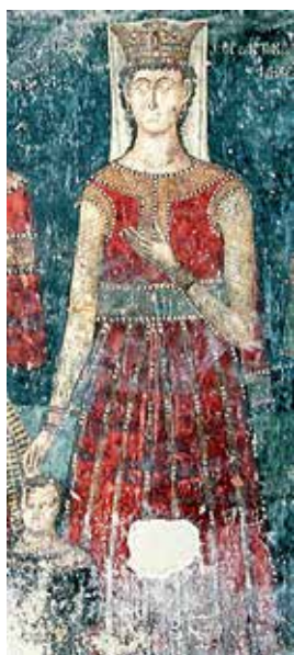
Fig. 11 St. Nicholas, Psača, Vladislava, wife of Sebastocrator Vlatko

Сл. 11 Св. Никола у Псачи, Владислава, супруга Севастократора Влатка