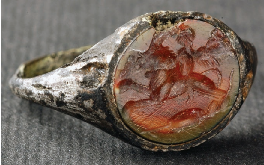
Fig. 3 Ring with intagli found at the bottom of the pool (the 1st-2nd century AD).

Сл. 3 Прстен са гемом пронађен на дну базена (I - II век нове ере).