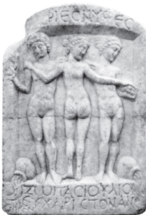
Fig. 6 Tile presenting the Tree nymphs - patron of the mineral baths Akve Kalide (the 3rd-2nd century BC).

Сл. 6 Плочница са Три нимфе – заштитнице минералних купатила Акве Калиде III- II век пре нове ере.