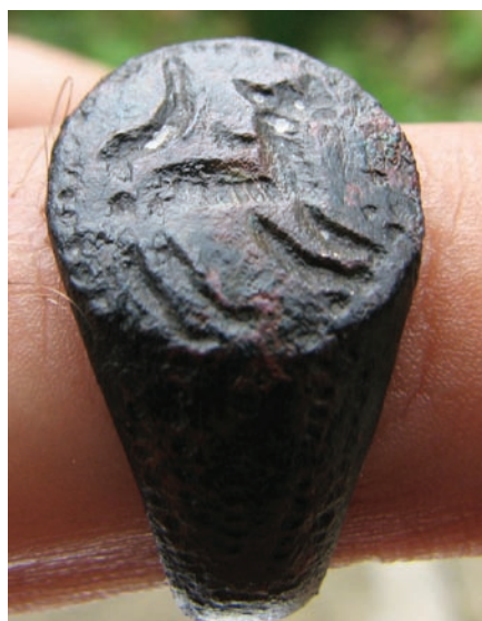
Fig. 5 Bronze signet ring from the 12-13th century.

After the creation of the Bulgarian State, the town of the hot springs was named already Thermal and / or Termopolis. The place appears in center of the events at the time of the Bulgarian ruler Tervel, who was a great strategist and statesman. In 708 in the vicinity of Thermal occurred one of the most shattering fights for Byzantium and Emperor Justinian II. In the subsequent expansion of the Bulgarian border to the south, the city of Thermal