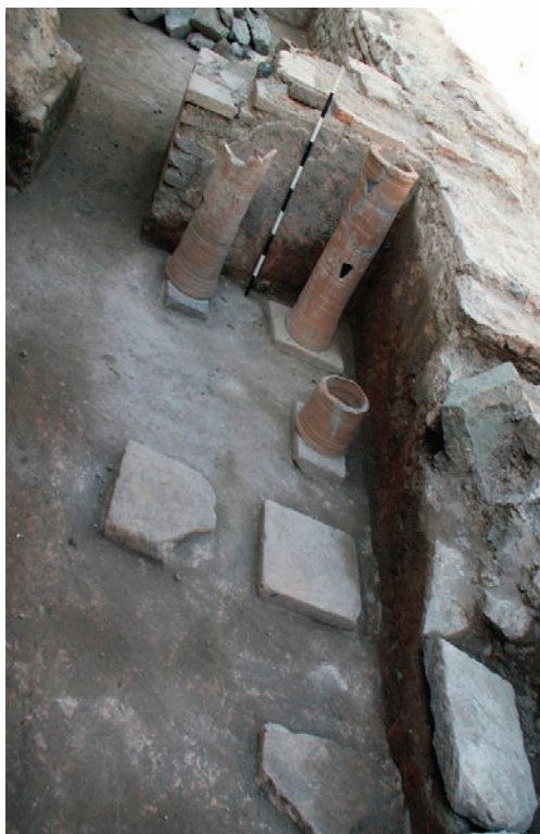
Fig. 2 The north pool in the caldarium of the ancient bath.

The earliest trace of the name “Akve Khalide” was found in the old Roman map Tabula Peutingeriana as a road station situated between Anhialo /Pomorie/ and Kabile /near Yambol/. 7 The first description of the town Akve Khalide is delivered in the writings “Roman history” by the Gothic historian Jordan /5 th century/, which describes the Gothic raids during 257-270 AD over the cities along the western Black Sea coast, when they were plundered and burnt to the ground. The city Akve Khalide took heavy damage, but the hot mineral baths were saved. 8 During the 257-270