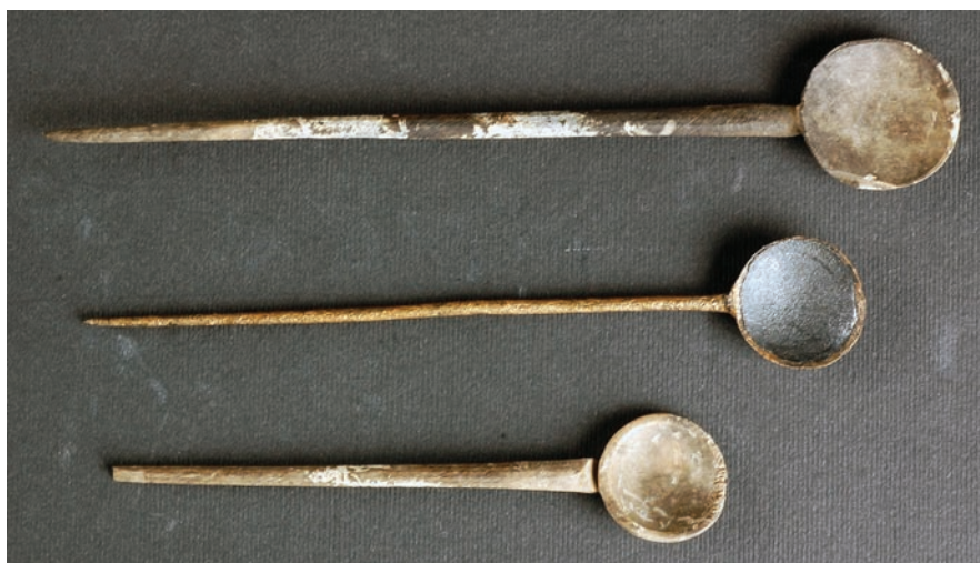
Fig. 4 Bone shovels for wellness oils.