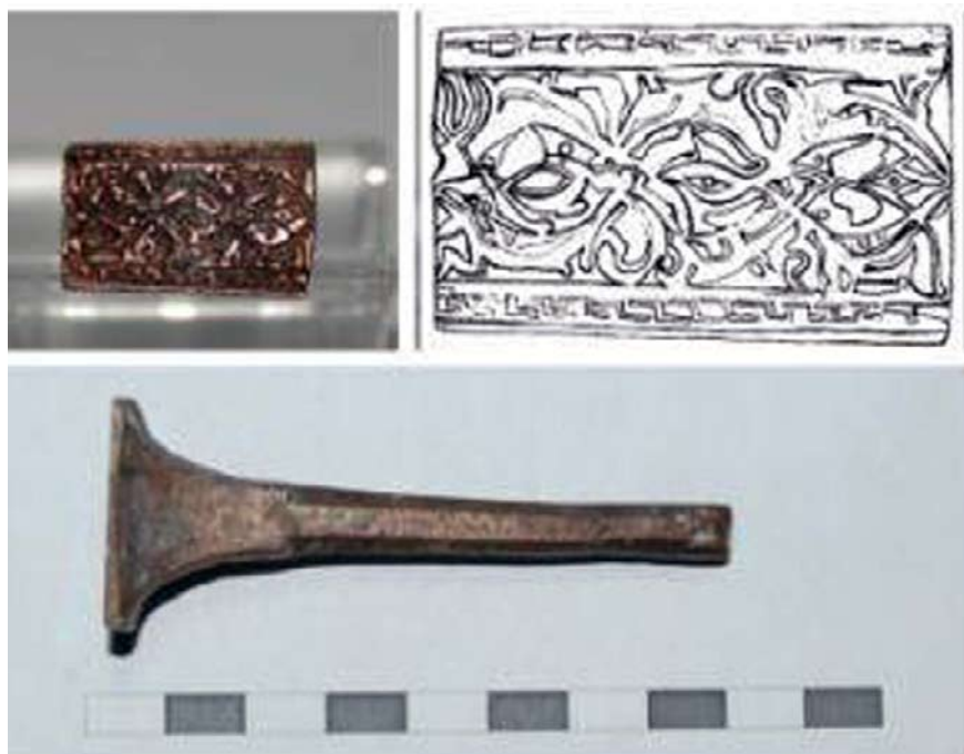
Fig. 3 Bronze seal for decoration of metallic hardware.

church of St. John inside the monastery, which was declared “royal”, ie endowed with the direct patronage of the Bulgarian rulers and later the Byzantine emperors. 5