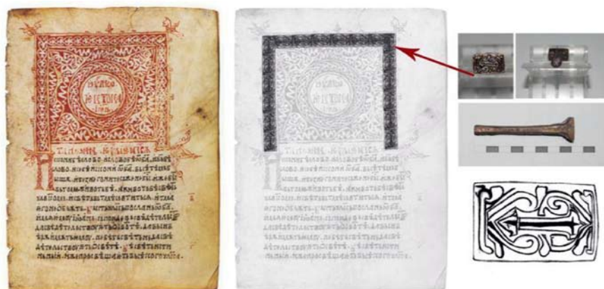
Fig. 2 Tetraevangelie from the 16th century ( Bulgarian National Library Sofia ); and a double sided bronze seal for ornamental breaks of the passages in the books.

entirely with murals. Unfortunately they are preserved only very few traces, mainly in construction embankments. The naos was covered with marble flooring and separation for the church singers next to the north and the south wall. The altar consists of three parts with height over 2 meters for the conchas. To the west the premises developed in a tripartite narthex and a wide exonarthex in which were discovered the tombs of two prominent men.