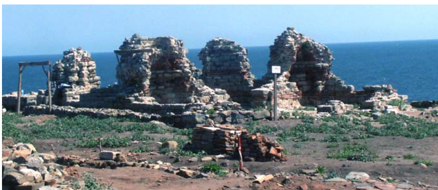
Fig. 1 Monastery St. John the Baptist located on the Island St. John near Sozopol, Bulgaria.

tery arose next to the church. In this period the monastery was in the range of the medieval Bulgarian Empire and became one of the most active missionary of Christian culture in Bulgarian lands among the Black Sea coast. 3